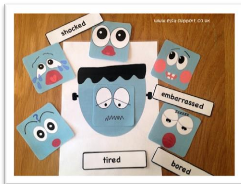
Frankenstein face and expressions