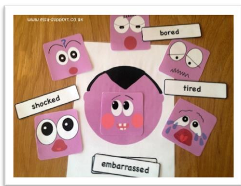
Dracula face and expressions.