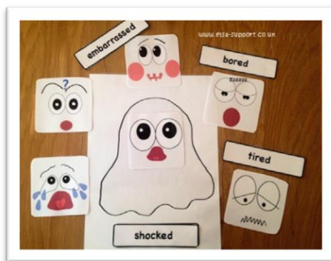
Ghost and expressions.